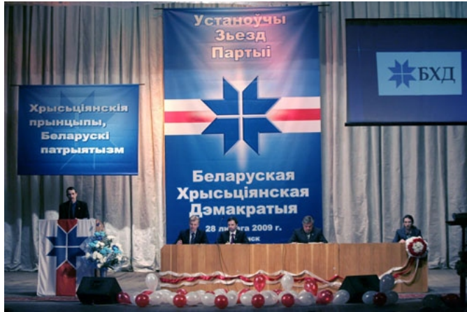
BCD Founding congress

Since 2005 more than 2000 persons joined BCD. At present the party has branches in more than 100 localities of Belarus. BCD Youth was formed in 2008; it works in different party projects and recruits volunteers and new members. On February 28, 2009 BCD Foundation Congress was held with over 600 attendees. As a result, an official decision on the