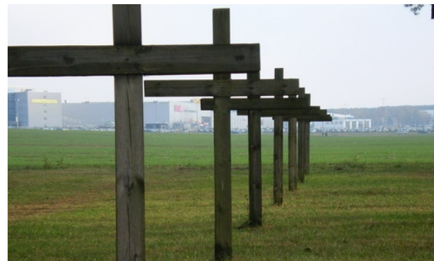
Kurapaty (by Minsk ring road): many thousands of people killed here under Stalin regime 1937-1941

Goal: to commemorate the 70th anniversary of the peak of Stalin's genocide in Belarus. The project includes support of former prisoners of conscience, and actions against honouring Stalin in modern Belarus.