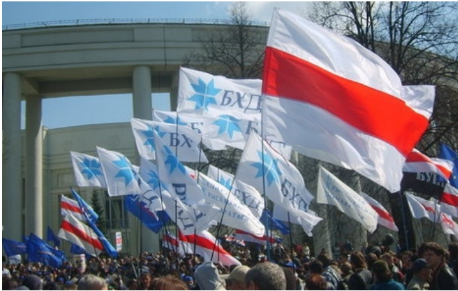
Christian Democrats on the march

In our work we take after Belarusian Christian statesmen, such as Euphrosyne of Polatsk, Cyril of Turaŭ, Dukes of Ostrog, Francysk Skaryna, Mikalaj Radziwil Chorny (the Black), Astafej Valovich, Lew Sapieha, Jazep Rutski and Belarusian Christian Democrats of the beginning of the 20th century.