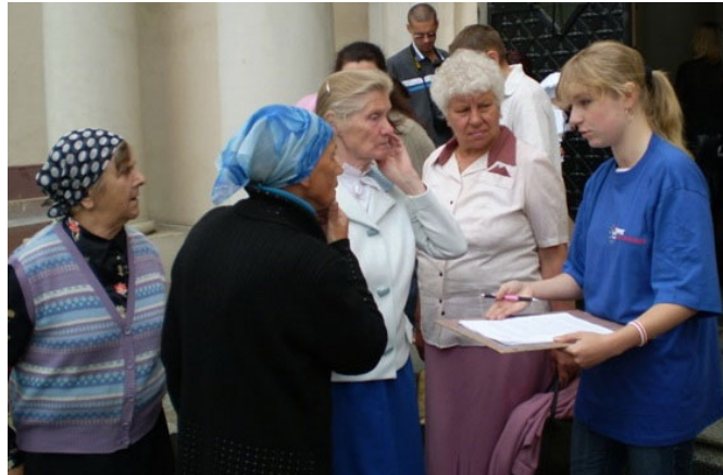
A volunteer talks with believers