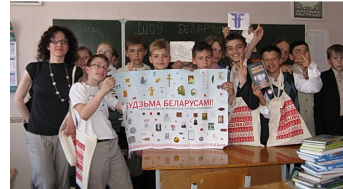
"Belarus Show" quiz in a school class

Goals: to raise the sense of civil and national responsibility among Christians and educate democratic activists in Christian values, history and culture.