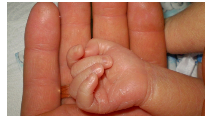
We are responsible for the life of new generations

Goals: to promote family values, contribute to the fight against alcoholic addiction and abortions.